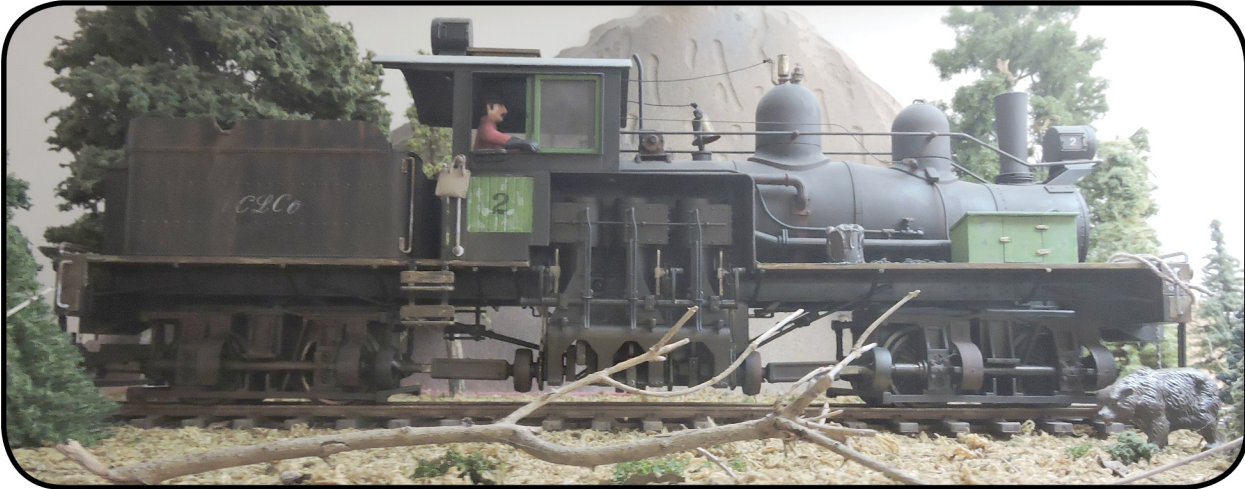
Note: No spark arrestor.