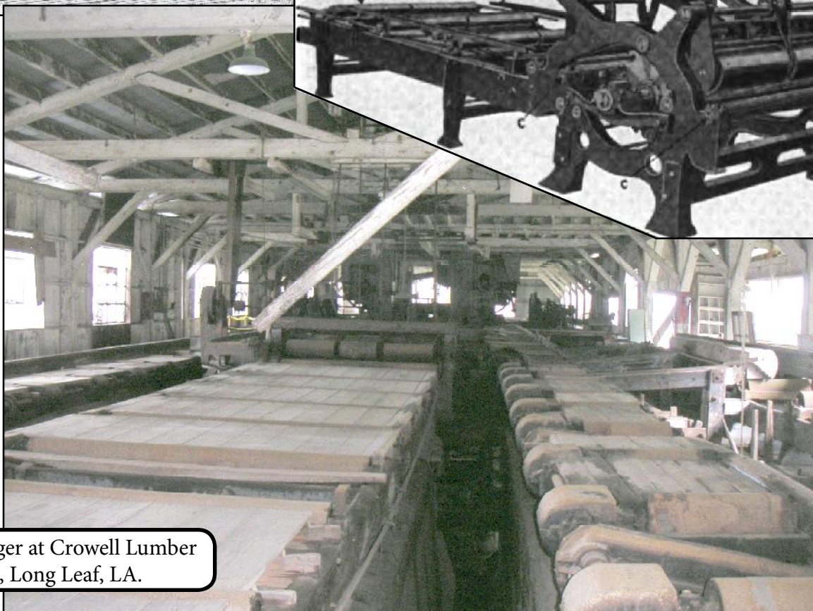
Tail of Edger at Crowell Lumber Industries, Long Leaf, LA.