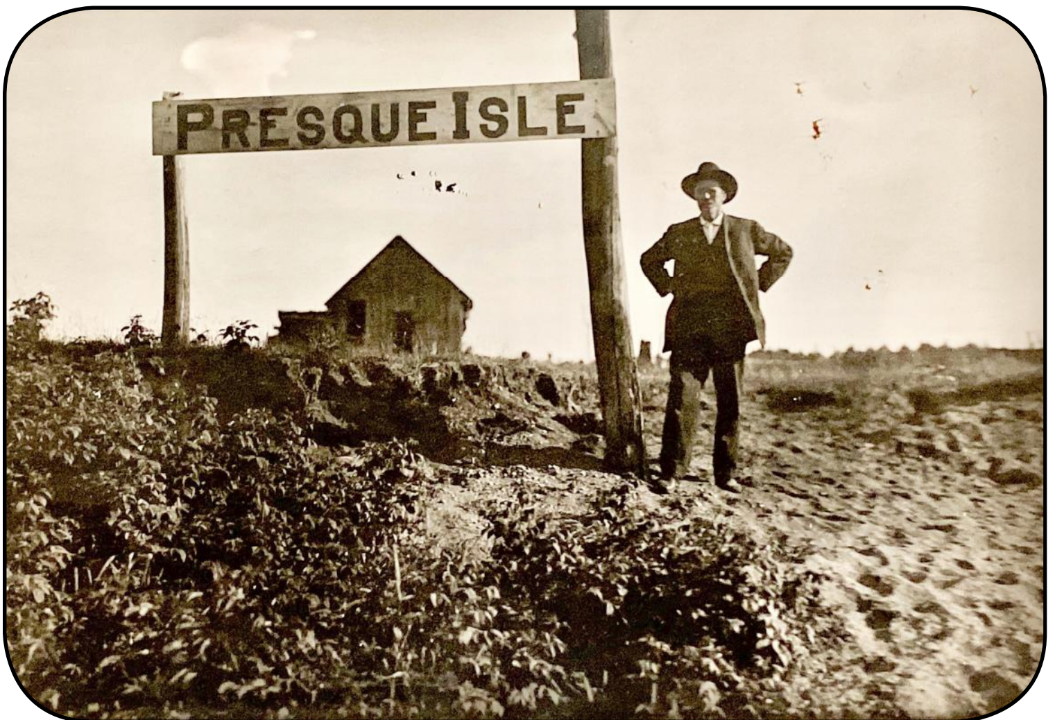
January 7, 1903, the original town of Presque Isle, Wisconsin was formed.